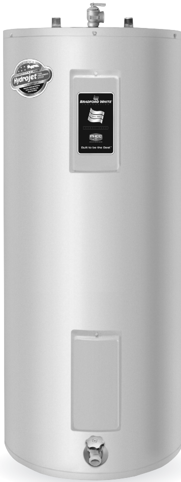
Photo is of RE250S6